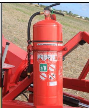
Fire Extinguisher supplied on all augers