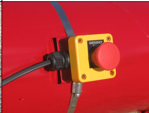
Emergency Stop Switch fitted near intake end of auger