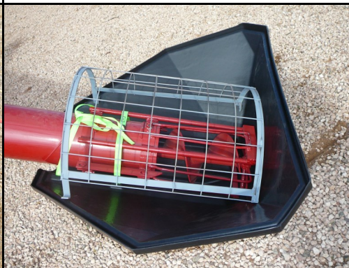
Optional Flexible Hopper with safety mesh