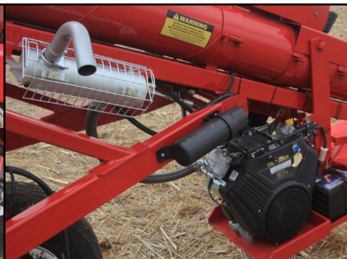
Optional Exhaust Upgrade. Kit only available on 27, 31 & 35 H/P Vanguards