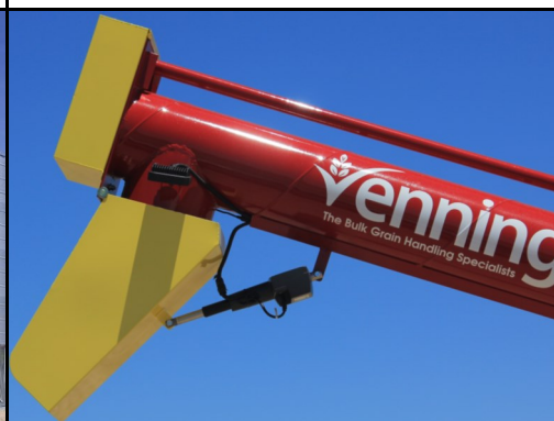
Optional adjustable discharge spout