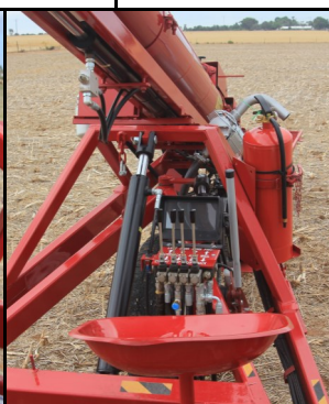
Seat and controls