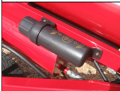
Document holder attached to Auger holds motor and auger operating instructions