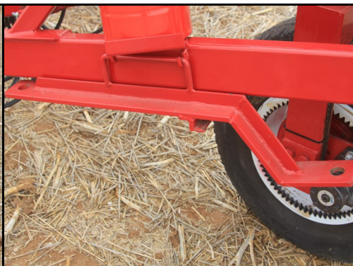
Tow hitch in storage when not in use