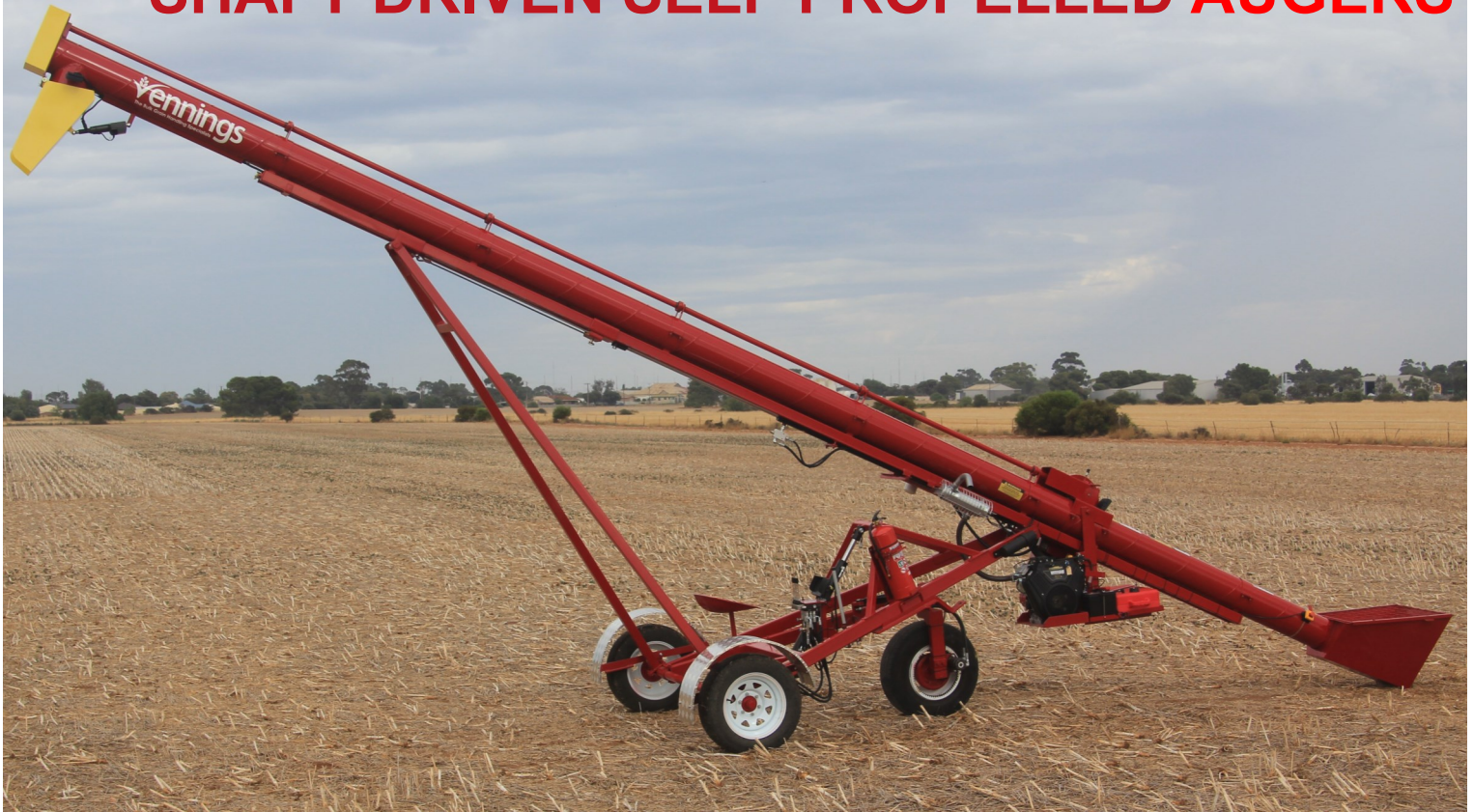
35' X 9" Self Propelled Auger Illustrated