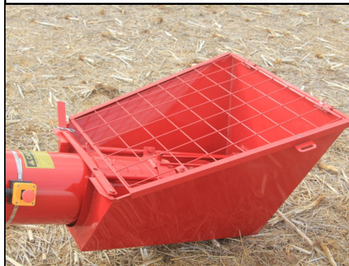
Standard Steel Hopper with safety mesh