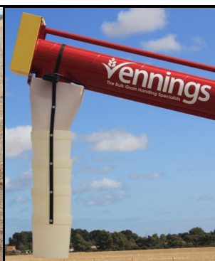
Optional Drop Spout 5 Section Spout