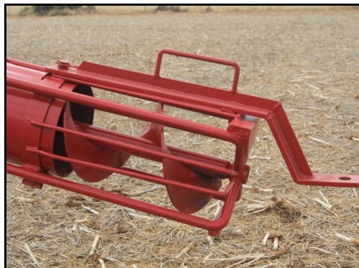
Safety Cage with removable tow hitch