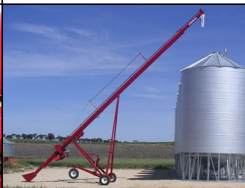
58' x 10" (now 60' x 10") Auger over a silo