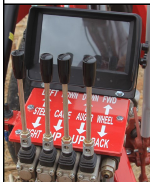
Controls With Optional 7" Waterproof Monitor